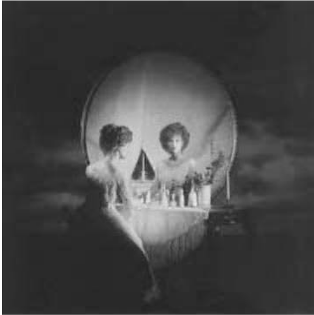
A woman in a mirror or a skull?