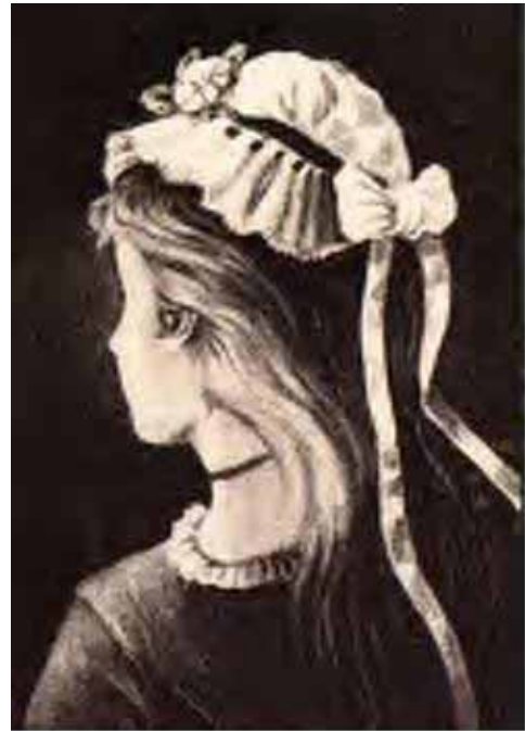
Old woman or young girl?